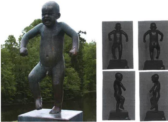
22 Cast iron gate by Gustav Vigeland: