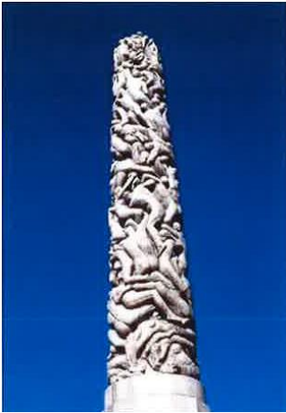
26 A sculpture by Gustav Vigeland: